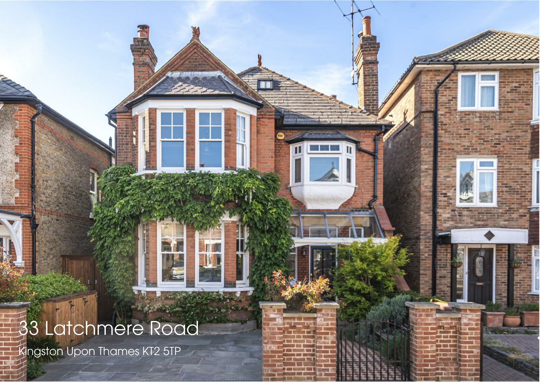
33 Latchmere Road Kingston Upon Thames KT2 5TP